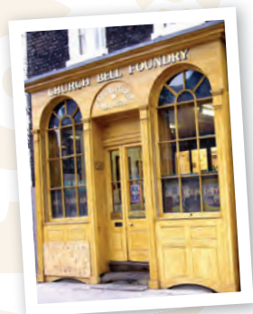
The Church Bell Foundry