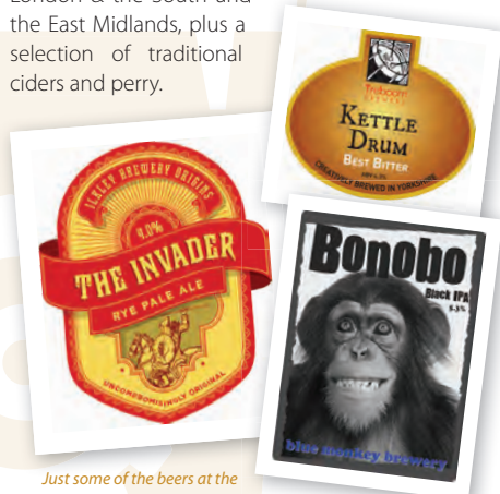
Just some of the beers at the Scunthorpe Festival this year.

We’re continuing the regional theme for our beers again, and this year we’re having two Yorkshire bars, showcasing twelve great beers on handpulled dispense from the White Rose county. In addition, on gravity, we’ll have a great range of other real ales from London & the South and the East Midlands, plus a selection of traditional ciders and perry.