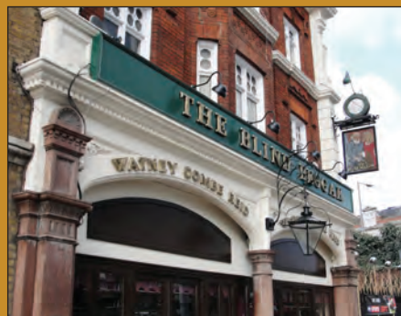
The Blind Beggar