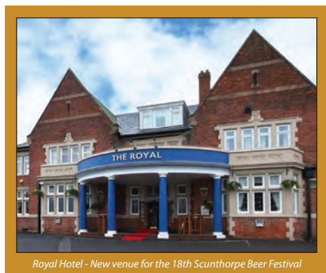
Royal Hotel - New venue for the 18th Scunthorpe Beer Festival

We’re not the biggest CAMRA festival around, but we like to think we’re one of the best! See you in September!