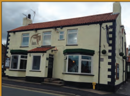
The newly refurbished Horn Inn, Messingham

The Horn Inn has an extensive food menu comprising pub classics and gastro dishes, all home-cooked to a high standard. Meals are available