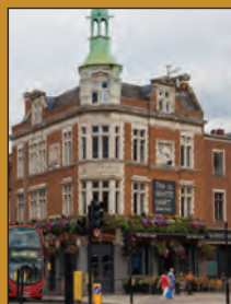
White Hart Brew Pub