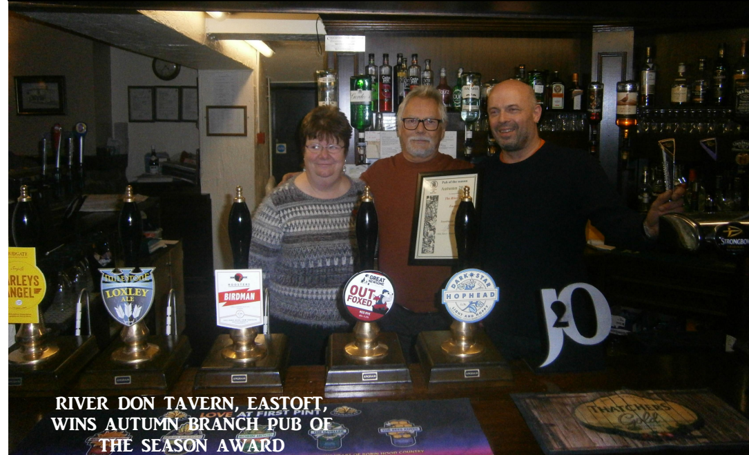
RIVER DON TAVERN, EASTOFT, WINS AUTUMN BRANCH PUB OF THE SEASON AWARD