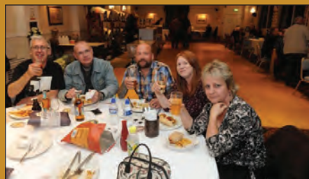
Customers enjoy sampling the beers at the festival

The festival tombola proved to be an interesting diversion while sampling the beers and ciders, and had to be restocked several times to keep up with demand. The selection of bottled beers, glasses, books and giant packets of Pipers crisps clearly proved too hard to resist!