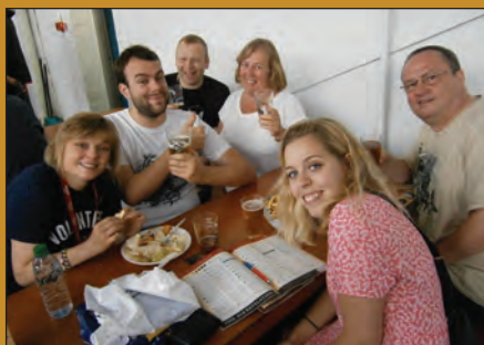
CAMRA members enjoying the beers at the GBBF

So, which is best? There's only one way to find out... (we're not doing that – Ed). Well I don't think it's fair to say one is better than the other as both have the enjoyment of good beer at their core. CAMRA has so far regarded craft keg beer as a niche product and have