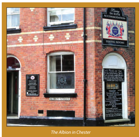
The Albion in Chester