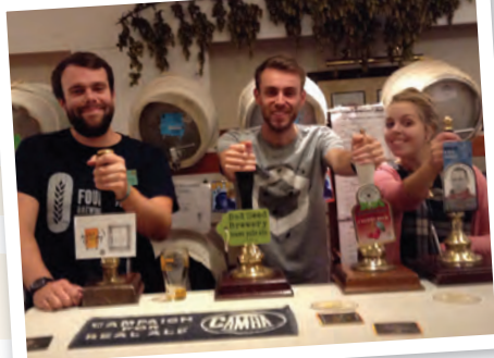
Young CAMRA members serving on the bar