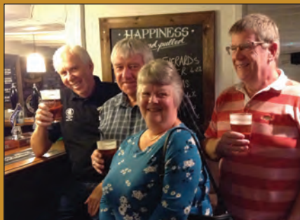
Branch members enjoy the Horn Inn beers.