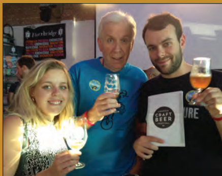
The author (centre) with family members at the London Craft Beer Festival